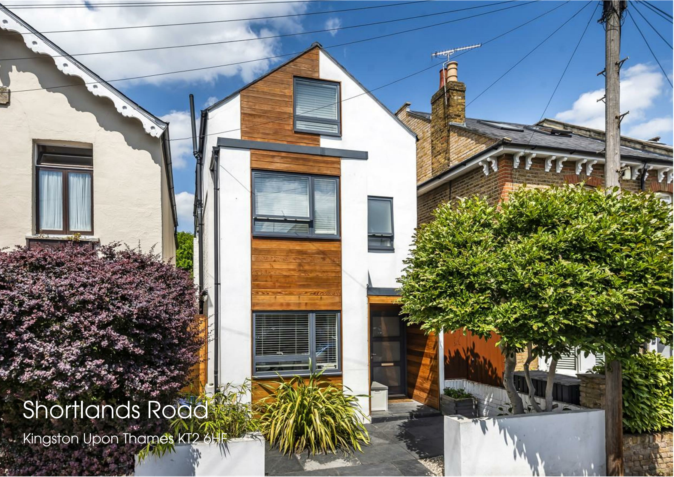
Shortlands Road Kingston Upon Thames KT2 6HF